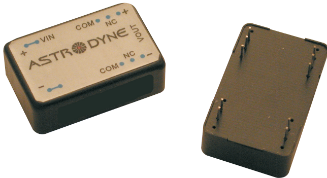
Unit measures 0.8"W x 1.25"L x 0.5"H